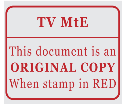
AE4551 max.45x51mm RM 53