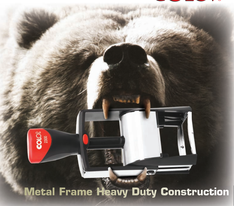
Metal Frame Heavy Duty Construction