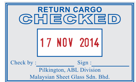
S2660/2 max.35x56mm RM 129