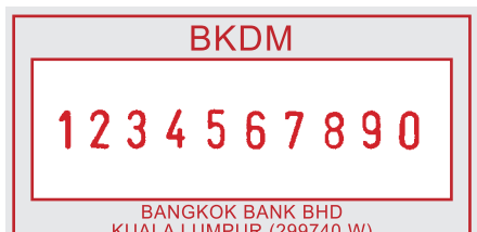
S2010/P max.29x57mm RM 157 5mm, 10 bands Numberer with text plate