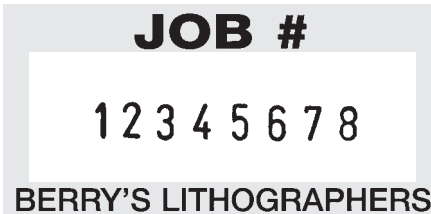
S2008/P max.29x57mm RM 153 5mm, 8 bands Numberer with text plate