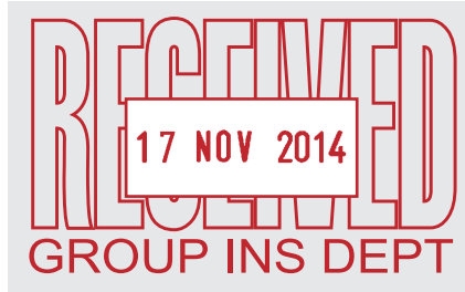
S2660 max.35x56mm RM 125