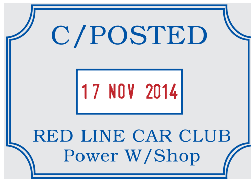
S2860/2 max.47x66mm RM 168

STAR REFRIGERATION (MALAYSIA) FINANCE DEPT